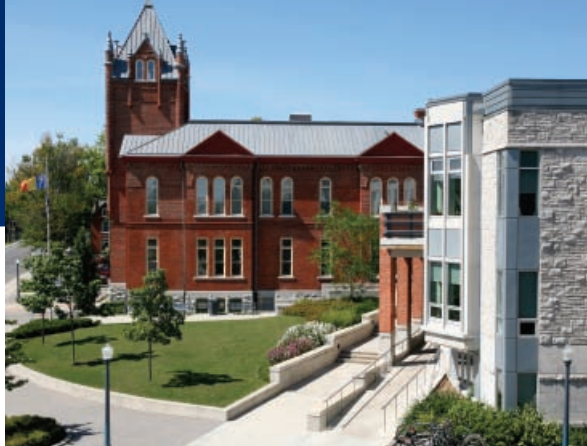
GOODES HALL • HOME OF QUEEN'S SCHOOL OF BUSINESS