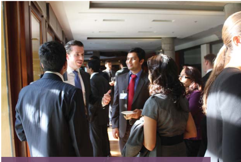
Full-time MBA students network with Queen's School of Business alumni at a Business Career Centre-hosted event at McKinsey's Toronto office in June 2013.