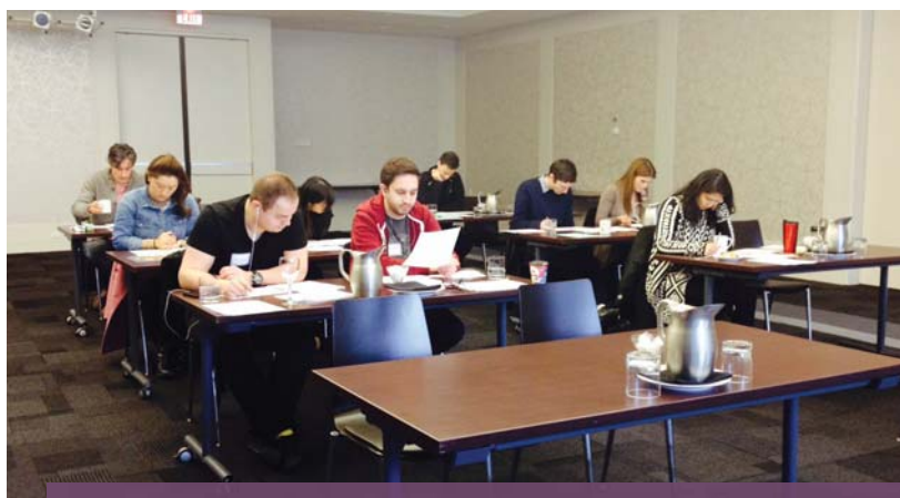
Alumni review applicants' Personal Statements of Experience in April, to assist in the selection of incoming Commerce students