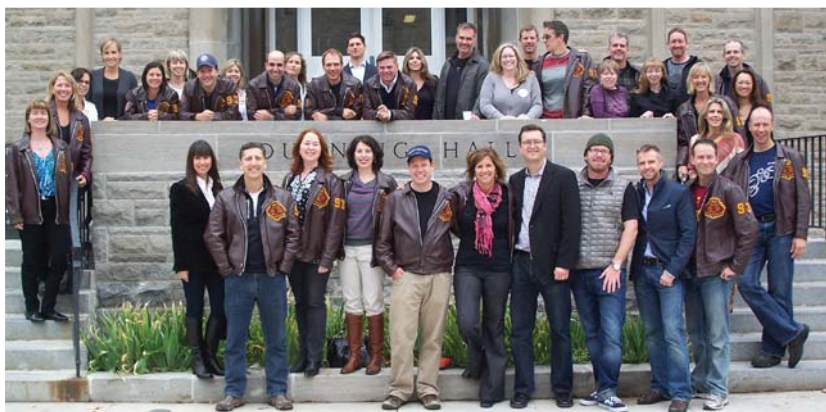
The BCom'93 class pose in front of their former Commerce home, Dunning Hall, at the October 2013 Homecoming Weekend.