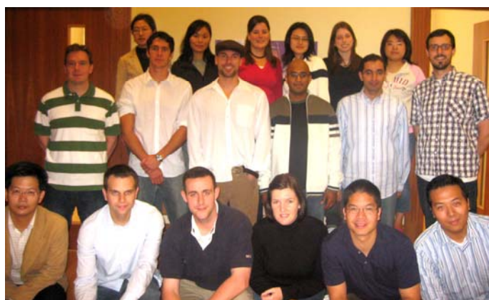
Welcome incoming students